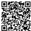
K120-EX 3D demo