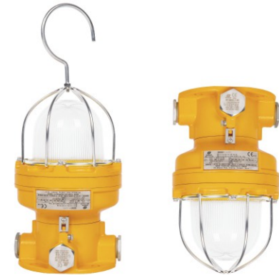
H: 手提式 Portable type