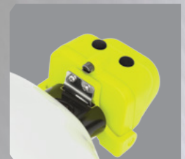
Tool-less secure pressure fit mounting