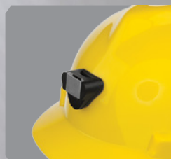
Fits most hard hats