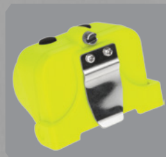
Integrated stainless steel clip