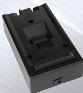
Wall or vehicle mounted charger