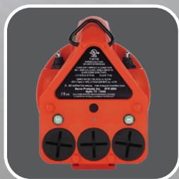
Rear-Facing Green Safety LED