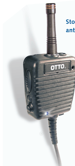
Storm with optional antenna connector