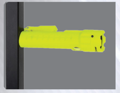
Hands-free magnet in base