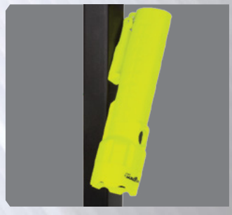
Hands-free magnet in pocket clip